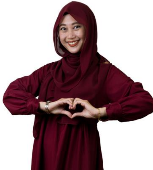
Mdm Amirah ML 5.2 HML