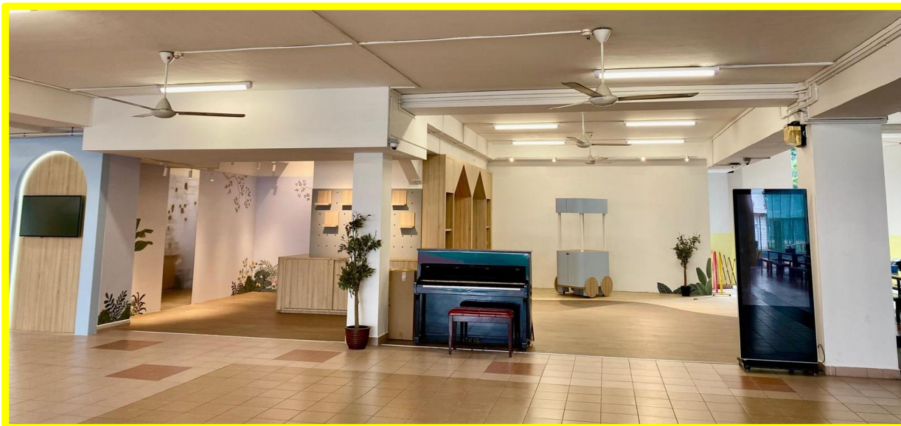
Newly-minted The Poised and Confident (TPC) Learning Corner