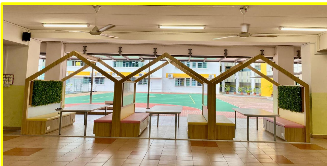
Newly-minted Study Pods at the School's Foyer