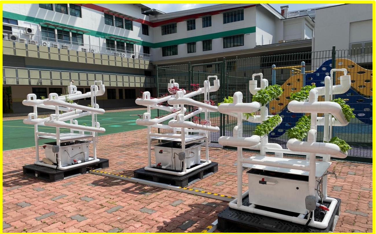
Newly-minted Hydroponic System