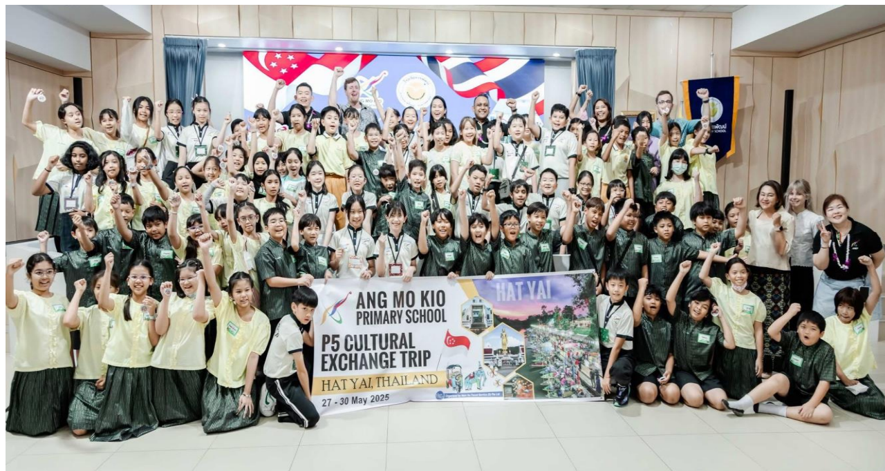
Photograph of students and staff from Ang Mo Kio Primary School and Warraphat School

20 of our Primary 5 students visited Warraphat School in Hat Yai, Thailand, as part of the school's cultural exchange programme in the last week of Term 2. Our students had the opportunities to experience Thai culture such as learning about traditional Thai costumes, playing Thai traditional games, trying out basic Thai boxing techniques and concocting a delicious local dessert. It was an enriching learning experience for our Primary 5 students who formed new friendships with the students from Warraphat School and developed cross-cultural skills.